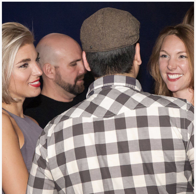
NYC Women Mix and Mingle with Eligible First Responders at "Rescue Me" Parties

This press release can be viewed online at: https://www.einpresswire.com/article/827750644