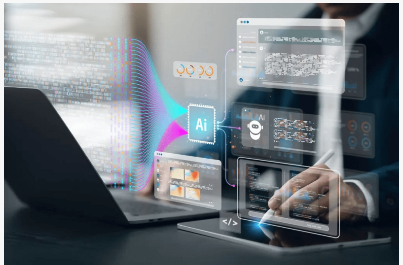
ITECS helps companies in Dallas and abroad with AI consulting, strategy, and implementation.