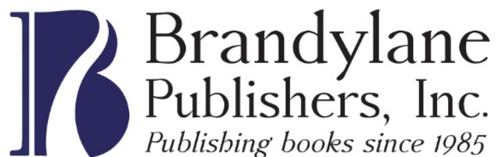
BrandyLane Publishers's logo

Gracie Be, the blue dog, was found on the streets as a malnourished, frightened puppy. Max, the white horse, was a rodeo success who for years helped cowboys corral and move cattle. Although the two were different in every conceivable way—in size, age, experience, needs, and