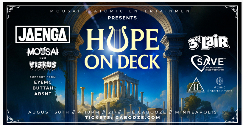
Hope On Deck Flyer