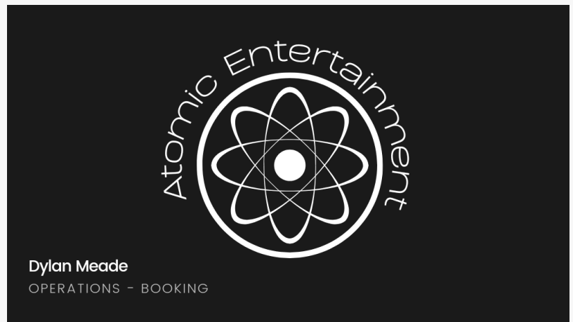
Hope On Deck Producer Atomic Entertainment