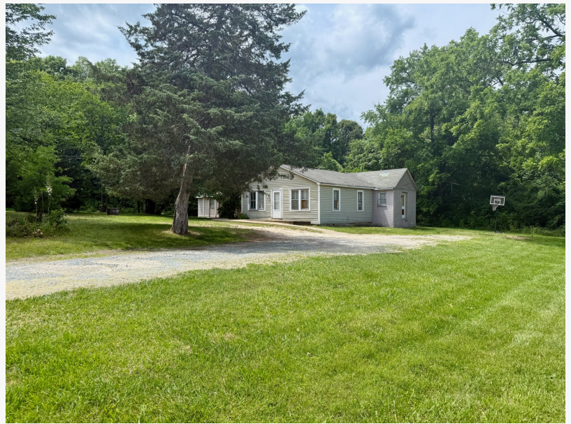
4025 Lee Hill School Dr., Fredericksburg, VA 22408