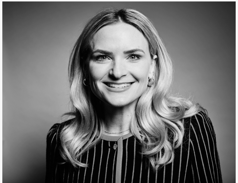
From Miss America to Memoirist

teetering between life and death at what's known as 'the edge of viability,' this story delivers universal lessons about resilience, surrender, and the tremendous power of faith.