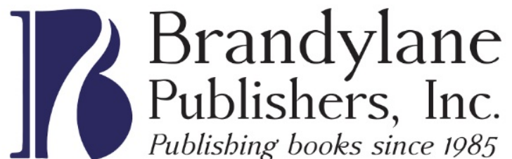
BrandyLane Publishers's logo