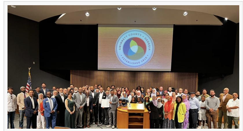
Muslim American Heritage Month Celebration -Gwinnett County

This press release can be viewed online at: https://www.einpresswire.com/article/828023338 EIN Presswire's priority is source transparency. We do not allow opaque clients, and our editors try to be careful about weeding out false and misleading content. As a user, if you see something we have missed, please do bring it to our attention. Your help is welcome. EIN Presswire, Everyone's Internet News Presswire™, tries to define some of the boundaries that are reasonable in today's world. Please see our Editorial Guidelines for more information. © 1995-2025 Newsmatics Inc. All Right Reserved.