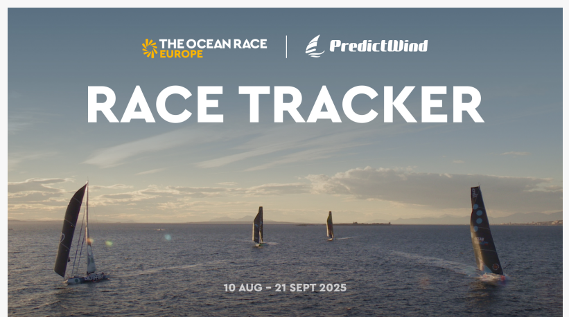
The Ocean Race Europe tracker - a new standard in race coverage

AUCKLAND, NEW ZEALAND, July 3, 2025 /EINPresswire.com/ -- The Ocean Race, often described as the toughest test of a team in sport and widely recognised as a leader in impactful ocean health initiatives, and PredictWind , a global leader in marine weather forecasting, are collaborating on a new race tracker.