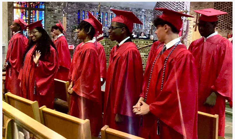
Member of The Chapel School Class of 2025