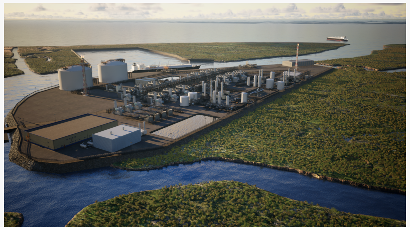
Argent LNG site overview Back to Front