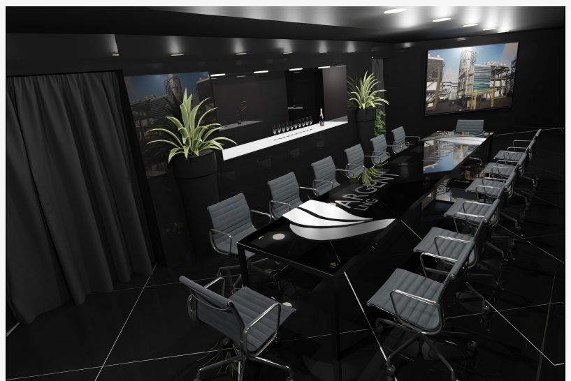
Argent LNG, GasTech Milan 2025 Booth D10 Main Hall Conference Room

“Location, location, location is the foundation of every successful development,” said Bass. “Port Fourchon is not only a critical stakeholder—it is the most capable port for energy logistics in the