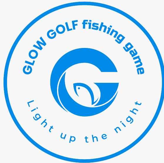
Glow Golf Logo

ST PETERSBURG, FL, UNITED STATES, July 3, 2025 /EINPresswire.com/ -- Move over board games and backyard darts — there's a new game in town that's lighting up family nights, parties, and fishing trips everywhere. Introducing Glow Golf: Fishing, the world's first glow-in-the-dark chipping game with an epic twist. Now live on Kickstarter , Glow Golf: Fishing is making waves with its unique fusion of golf, fishing, and LED-fueled fun.