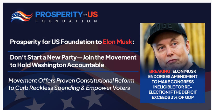
Don't Start a New Party - Join the Movement to Hold Washington Accountable