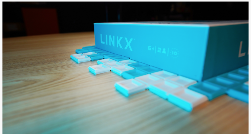
Easy Set-up and Fast Play