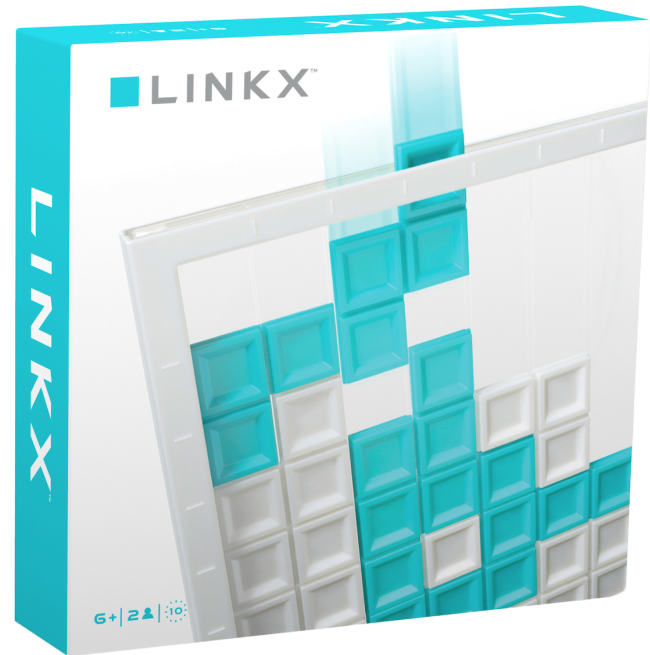
Unbox Your Strategy

In Linkx, all pieces are on the table and there is a set group of shapes. If one is keeping track of what pieces their partner is placing, and they are using probability to their advantage, they'll have a better idea of where to block. While simple and straightforward to set