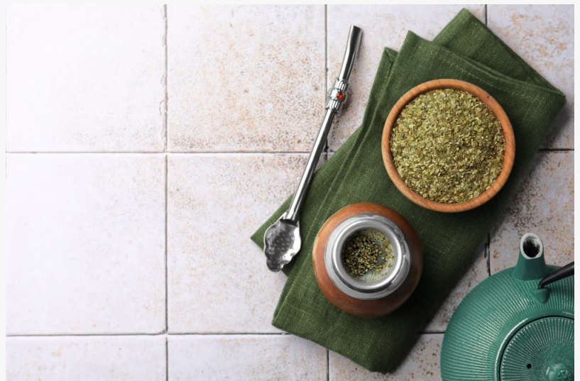
Discover the ritual of mate with one of Fernwayer's Experience Makers on your next trip to Argentina.