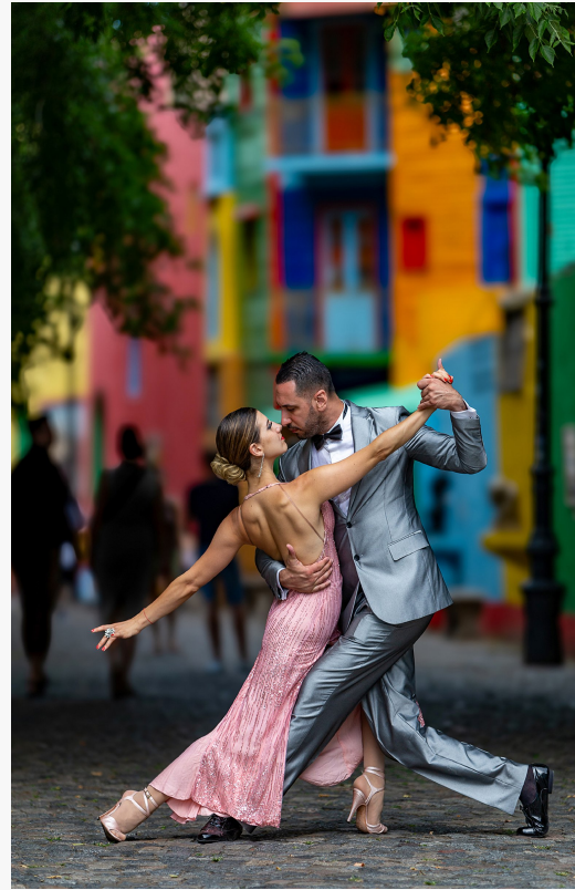
Experience tango in La Boca with Fernwayer's new Buenos Aires tours.