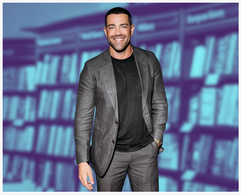
Actor Jesse Metcalfe

The novel follows the journey of Jet Brine, a former baseball star grappling with the highs and lows of life after his career ends. The story's universal themes of redemption and resilience have struck a chord with readers and now aim to captivate moviegoers. "There aren't enough great baseball movies on the market. I can think of