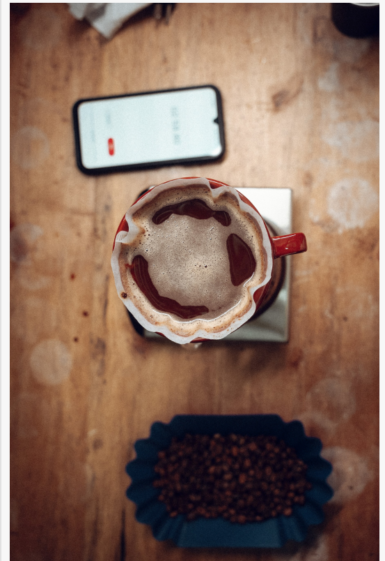
A V60 pour-over showcasing one of Spirit Animal Coffee's Cup of Excellence-winning brews, served fresh at origin.

This press release can be viewed online at: https://www.einpresswire.com/article/828313655