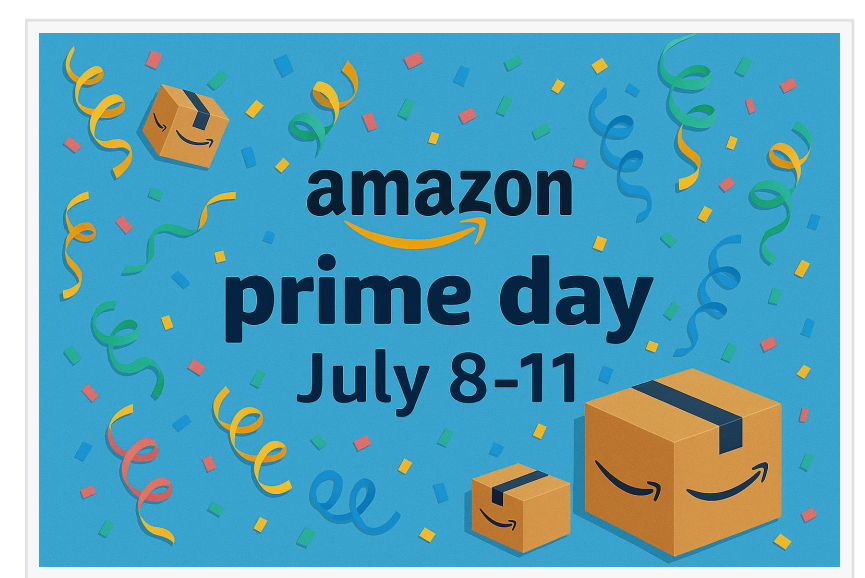
prime day 2025

Keyless Access, Customized Control The move toward keyless living is being driven by a new generation of door locks designed to adapt to a variety of lifestyles—from homeowners seeking