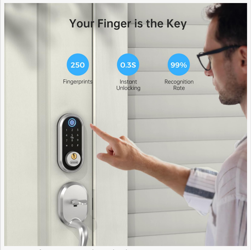
Y1-SBF fingerprint door lock