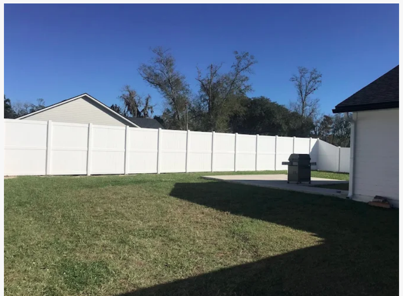
vinyl fence panels

Additionally, internal workflows were revised to improve communication between project managers, field teams, and homeowners. These enhancements allowed projects to move from quote to completion more quickly, without sacrificing workmanship or attention to detail.