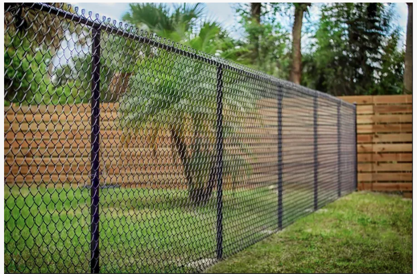
chain link fence installations