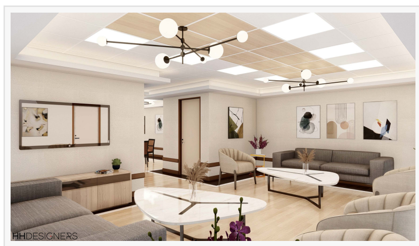
Imperial, a Villa Center Remodeling

DEARBORN HEIGHTS, MI, UNITED STATES, July 5, 2025 / EINPresswire.com/ -- Villa Healthcare is proud to announce the completion of a major remodeling of Imperial, a Villa Center, further reinforcing its commitment to providing quality care in a warm and welcoming environment.