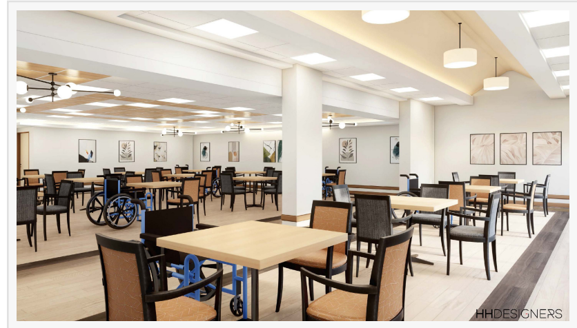
Imperial, a Villa Center Remodeling

Brandon Durkin Villa Healthcare mediarelations@villahc.com Visit us on social media: LinkedIn Facebook