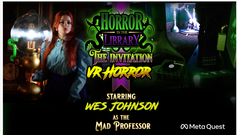
A Victorian horror game set in an interdimensional Library for Meta Quest VR