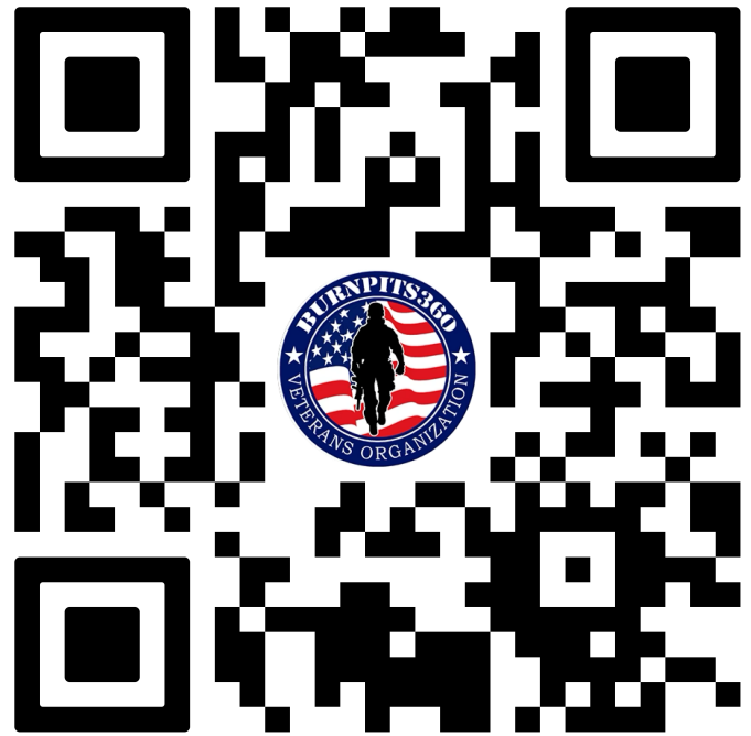
ATX Link QR Code

It is more than a tribute – it is a call to action.