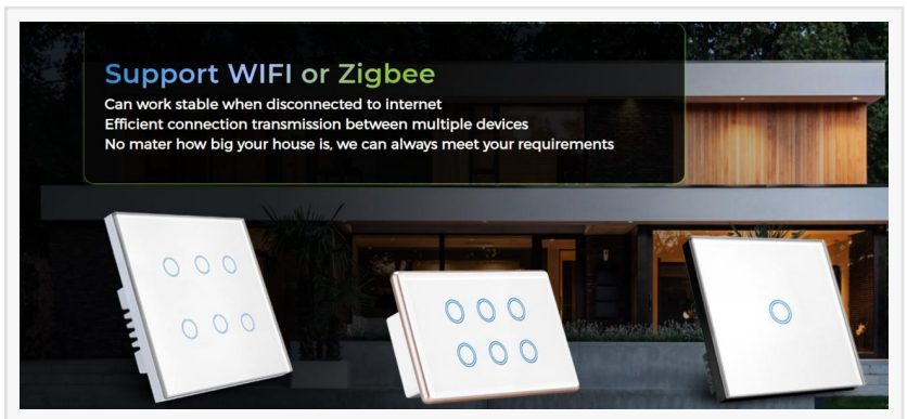
Zigbee Touch Switches of MakeGood Industrial Co., Ltd

Shenzhen International Smart Home Expo (C-SMART): A Glimpse into Tomorrow's Living