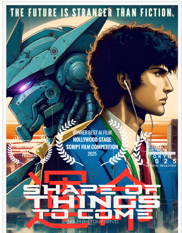
The Future is Stranger Than Fiction: "Shape of Things to Come" official movie poster featuring Tommy Timex and Autonomous: The Merciless Mech.

"Shape of Things to Come" is a thought-provoking animated short film exploring the intersection