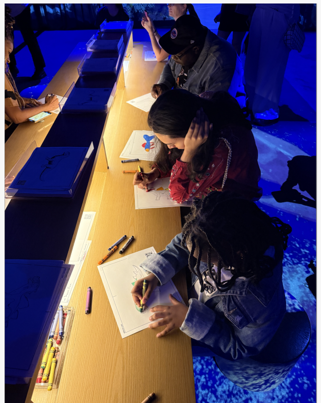
Mercer Labs Community: from drawing to digital art

© 1995-2025 Newsmatics Inc. All Right Reserved.