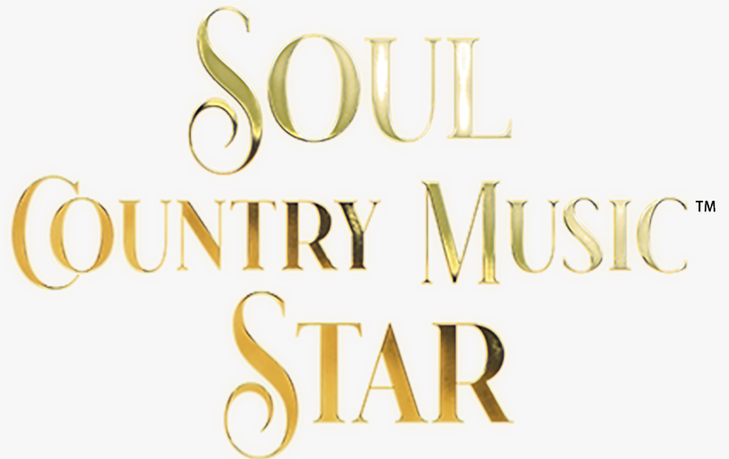
Soul Country Music Star logo

As part of the Los Angeles tour stop, the Bill Pickett Invitational Rodeo will welcome 100 guests recovering from the Eaton fire in the Altadena/Pasadena community for a joyful day of rodeo fun, connection, and healing. In partnership with the International Black Women's Public Policy Institute, the event will also provide access to valuable resources, and celebrate the strength and resilience of these individuals as they rebuild their lives.