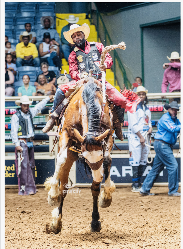
BPIR Texas Connection Bronc Rider