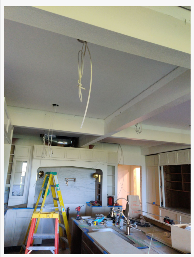
Complete home electrical rewiring with Melby Electric