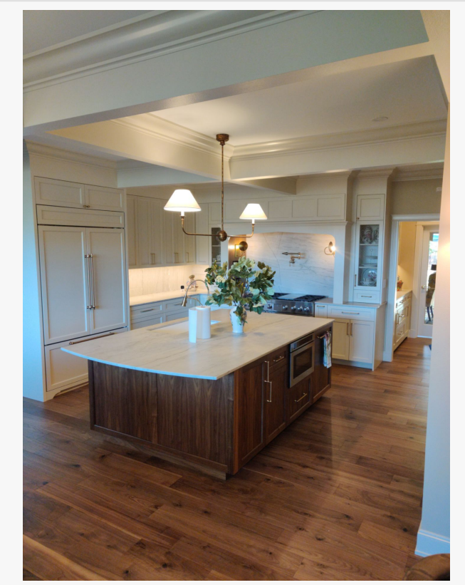
Finished electric remodeling project in the kitchen and many other rooms of the home with Melby Electric

Melby Electric is also committed to keeping up with changing technologies.