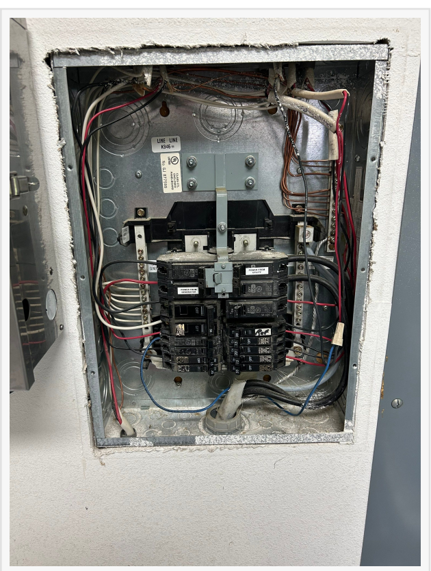
Start of installing a new electric subpanel with Melby Electric

But safety isn't the only goal. Melby Electric focuses on building smart systems ones that are efficient, expandable, and ready for what comes next. EV charger in the garage? Covered. Smart switches and app-controlled lighting? No problem. They make