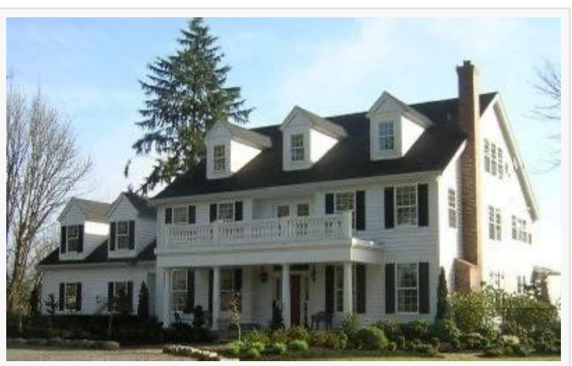
Complete electrical remodeling project with Melby Electric in Marysville

MARYSVILLE, WA, UNITED STATES, July 7, 2025 /EINPresswire.com/ -- A home in Snohomish just got a serious electrical upgrade, thanks to Melby Electric out of Marysville. It was a full residential electrical remodel and not just a random light fixture swap. The team handled everything from outdated wiring to a new panel, new circuits, and energy-efficient lighting for this Snohomish home. What the homeowners received was a codecompliant system, modern, futureproof remodeled electrical system designed with both safety and convenience in mind.