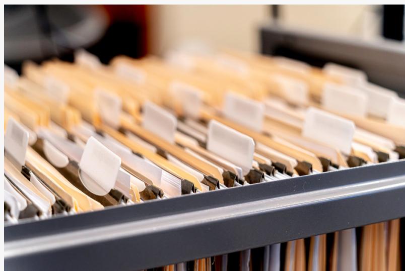
secure file storage in Los Angeles