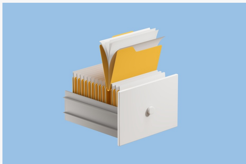
File Storage Solutions