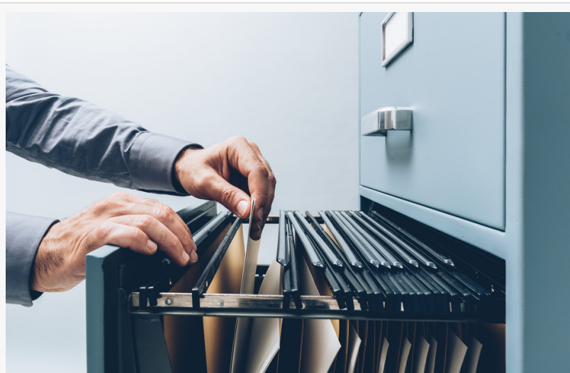
file storage in Los Angeles