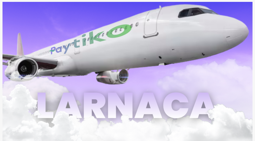
expansion to Larnaca Cyprus

LARNACA, ISRAEL, July 7, 2025 /EINPresswire.com/ -- Paytiko, a premier global payment orchestration platform, is proud to announce its official expansion to Larnaca Cyprus—an essential milestone in the company's international growth trajectory and a reaffirmation of its unwavering commitment of delivering secure, seamless, and forward-thinking payment technologies on a global scale.