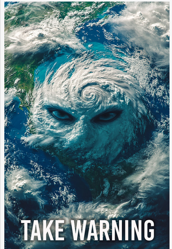
Poster art for the film adaptation of The Viral Limit (renamed Take Warning for film)