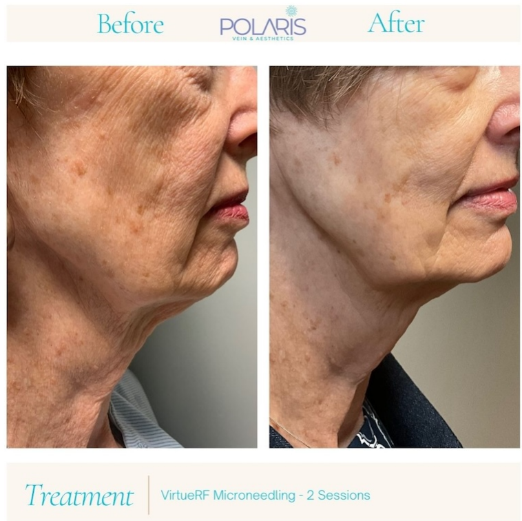
Before and After: VirtueRF Microneedling at Polaris Vein & Aesthetics