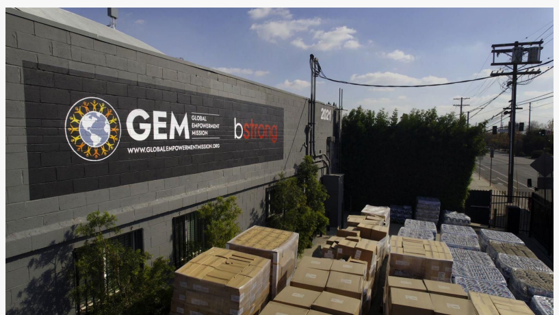
GEM Los Angeles Headquarters

County since January 9, 2025, under federal disaster declaration DR-4856-CA, in response to the catastrophic wildfires with a rapid and robust relief operation. Within the first 72 hours, GEM organization secured and outfitted a large, centrally located warehouse to serve as its logistical hub, enabling the rapid distribution of