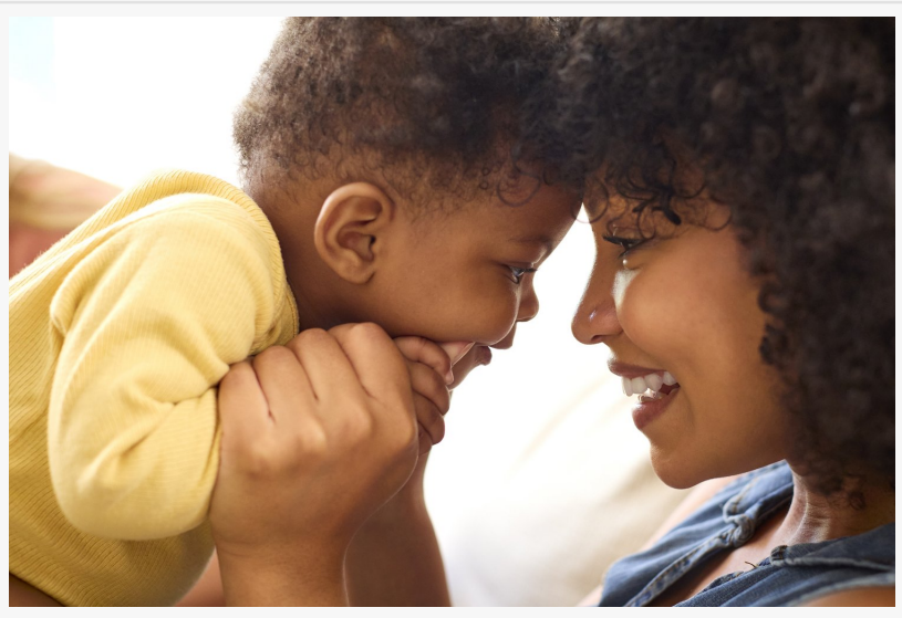
Nurturing connections: The Natural Nanny Collective supports families while championing maternal mental health and equity.

understands the significant challenges many mothers and families face concerning mental health and accessing fair, quality resources. These challenges can profoundly impact the wellbeing of entire families, underscoring the urgent, nationwide need for robust, accessible support systems. By facilitating <u>high-quality childcare</u>, The Natural Nanny Collective empowers parents, knowing their choice also contributes to vital maternal support.