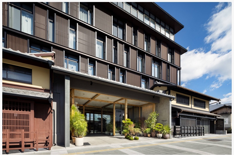
Nohga Hotel Kiyomizu Kyoto

Capacity: 10 people *reservation required