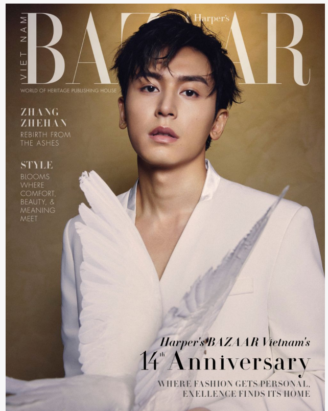
Cover 2 of Harper's Bazaar Vietnam