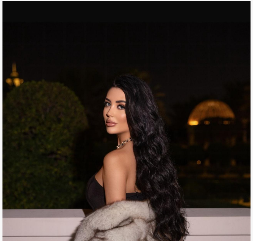
Rhinoplasty in turkey

Turkey ranks among the top 5 countries globally for rhinoplasty, and maintains a success rate above 95%. This is largely due to the country's emphasis on medical training, adherence to international safety standards, and investment in surgical innovation.