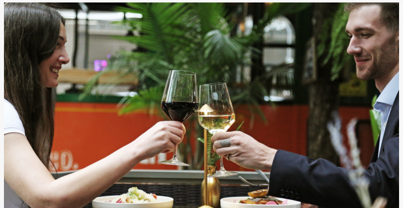
Elegant anniversary dinner setup at Ayza Wine & Chocolate Bar, a romantic restaurant in Midtown Manhattan known for fine wines, gourmet chocolates, and intimate ambiance.