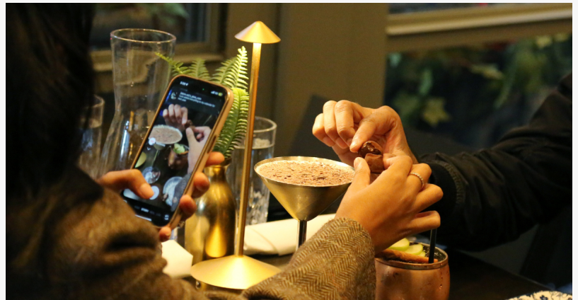
Couples enjoying a romantic dinner at Ayza Wine & Chocolate Bar, a cozy Midtown Manhattan restaurant perfect for anniversaries, date nights, and wine lovers.

A February 2025 report by Cloudwards, a prominent research firm specializing in travel and lifestyle analytics, identified New York City as the top U.S. city for romantic proposals in 2025. This finding was corroborated by a separate study from Family Jewelers, published on February 23, 2025, which also positioned New York at the forefront for romantic proposals. Further solidifying its romantic standing, a Time Out survey conducted in April 2025, and subsequently reported by Time Out New York on April 17, 2025, ranked New York City as the second most romantic city globally. These assessments underscore the city's unique capacity to foster romance amidst its vibrant urban landscape.