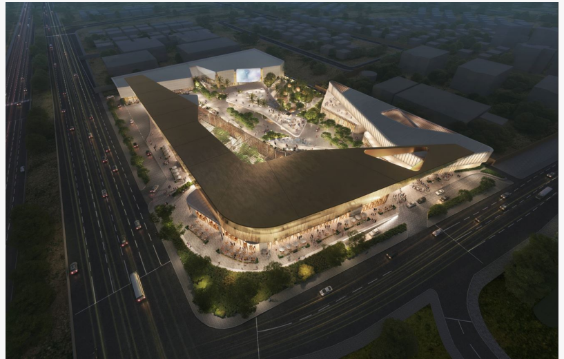
A World-Class Destination Redefining Luxury Leisure and Dining in Khobar

DUBAI, UNITED ARAB EMIRATES, July 9, 2025 /EINPresswire.com/ -- Lemay is proud to tell the story of The Gold through the design of its exquisite leisure and dining destination that will come to life on the famed King Salman Road, in the city of Khobar. Visitors will be invited to shop, be entertained, to dwell, and to enhance their well-being across a distinctive environment spanning over 32,000 square metres. The Gold, which began construction in April 2025, will soon establish itself as a new luxury lifestyle hub in Saudi Arabia.