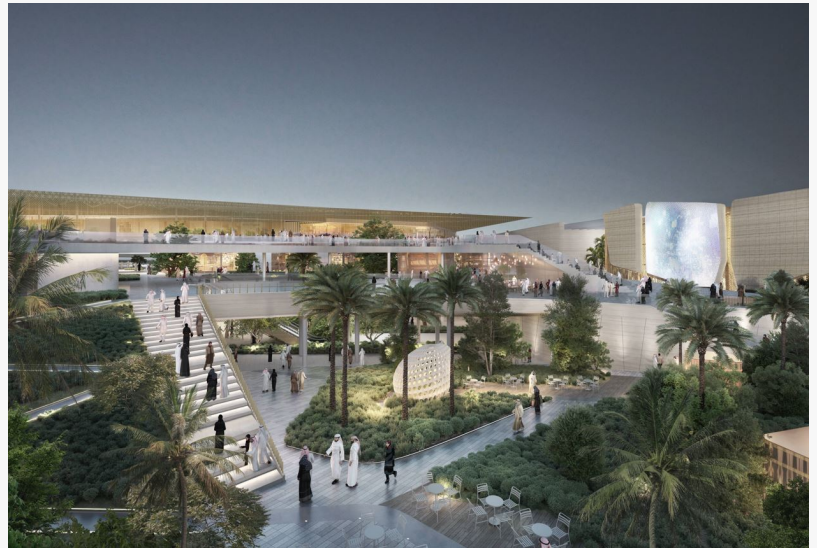
A new luxury lifestyle hub in Saudi Arabia

The flow of traffic and connectivity between spaces will be discrete from the exterior. Once inside, visitors will enjoy an intuitive experience that will unfold before them with every step. Year-round public spaces will support cultural programming unique to Khobar and the surrounding region. Entertainment will include six state-of-the-art cinemas—one of them open-air—and a cutting-edge bowling centre designed for physical activity and social engagement. Finally, a women-only exclusive wellness centre will provide a sanctuary of luxury, fitness, and relaxation like no other in a commercial setting.