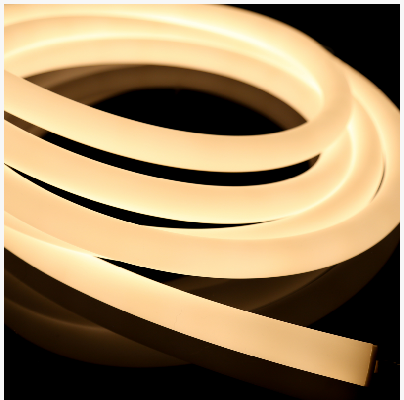
Eluxtra™ 360° LED Neon - 4-in-1 - RGB + 6500K

that match their needs. Our work transforms environments in an array of industries, including retail display, entertainment, trade show/exhibit, hospitality, casino gaming, and residential &