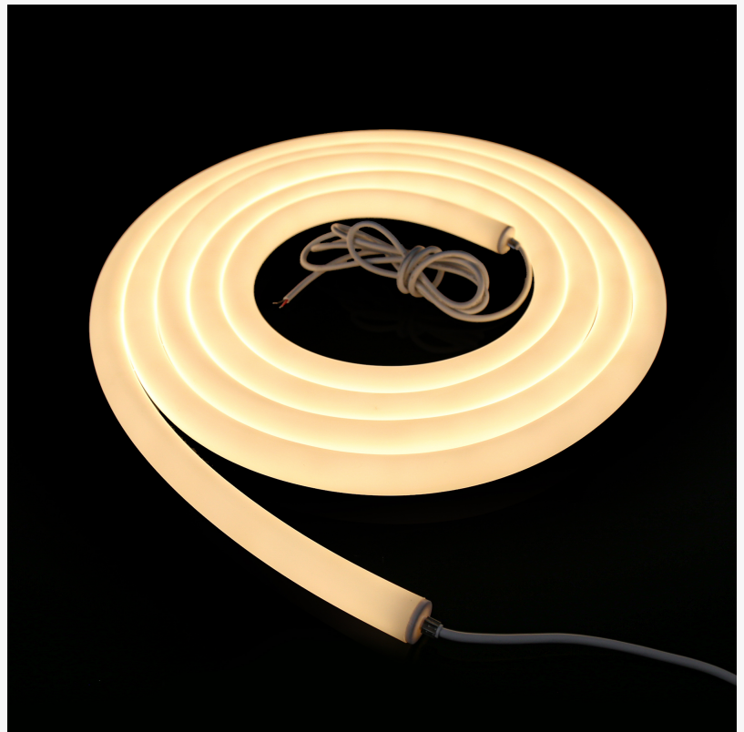
Eluxtra™ 360° LED Neon - 4-in-1 - 5-meter reel