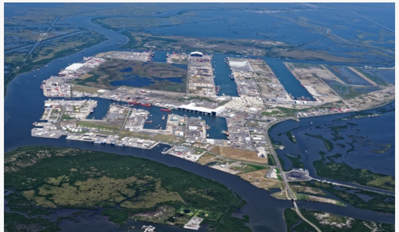
Port Fourchon is a multi-use coastal port that functions primarily as a land base for multiple offshore energy support service companies.

With the completion of this deal, Argent LNG has added the additional acres to its project, bringing the project's total footprint to approximately 900 acres. The expanded site provides the scale and flexibility to optimize facility design, enhance logistics efficiency, and support future phases of growth as global LNG demand accelerates.