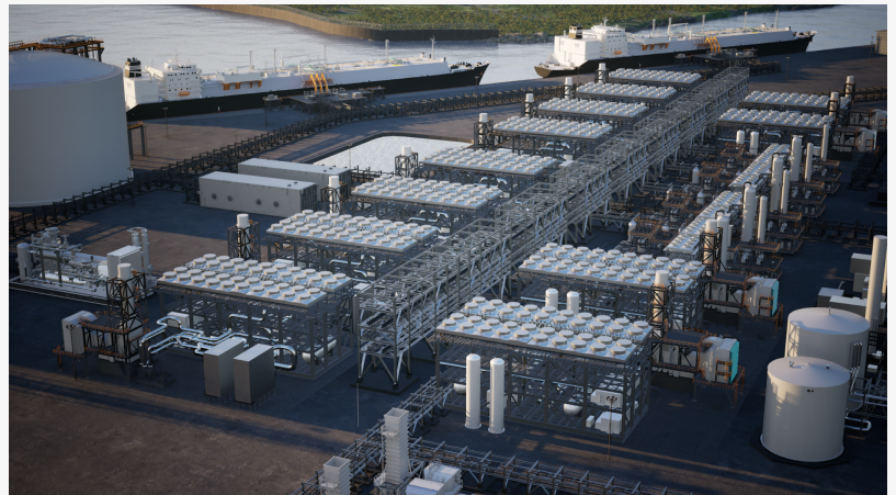
Proposed project targets approximately 24 million tons per annum (MTPA) of production capacity