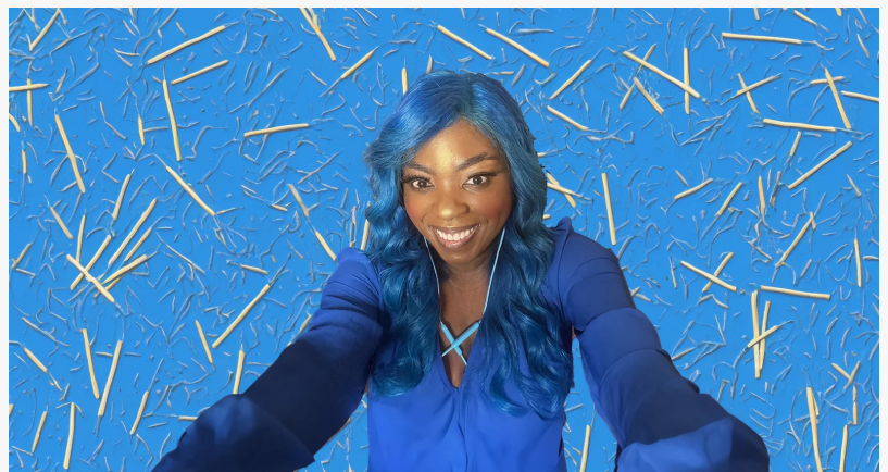
Blue Saffire featured in Top London magazines