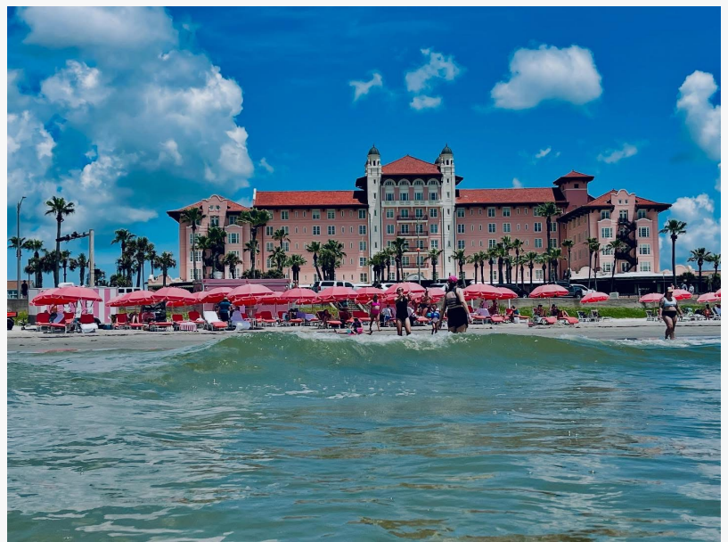
Gigi Beach Club is now open via “a first come-first served” to the public and hotel guests