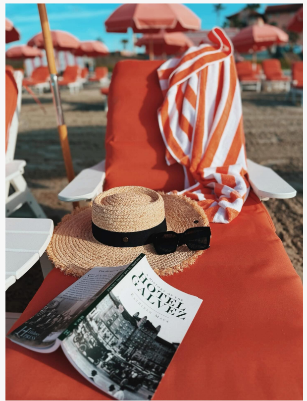
Guests at GiGi Beach Club relax on bright pink cushioned chaise lounges, pink striped beach towels, side tables and a special menu of food and cocktails

https://www.dropbox.com/scl/fo/h1up58uil0m6yugb1btv2/h?rlkey=ppicnrvhz7zivubkaa0hfl3ex&