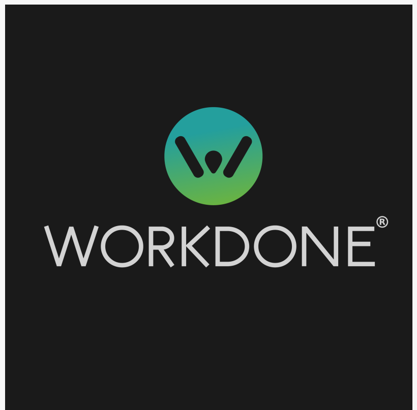
WorkDone center logo

To support this expansion, Canoga Perkins is installing WorkDone's Corporate Memory®, which observes work in real time, identifies best practices, and transforms that knowledge into intelligent automation to support human teams, ensuring operations run smoothly and