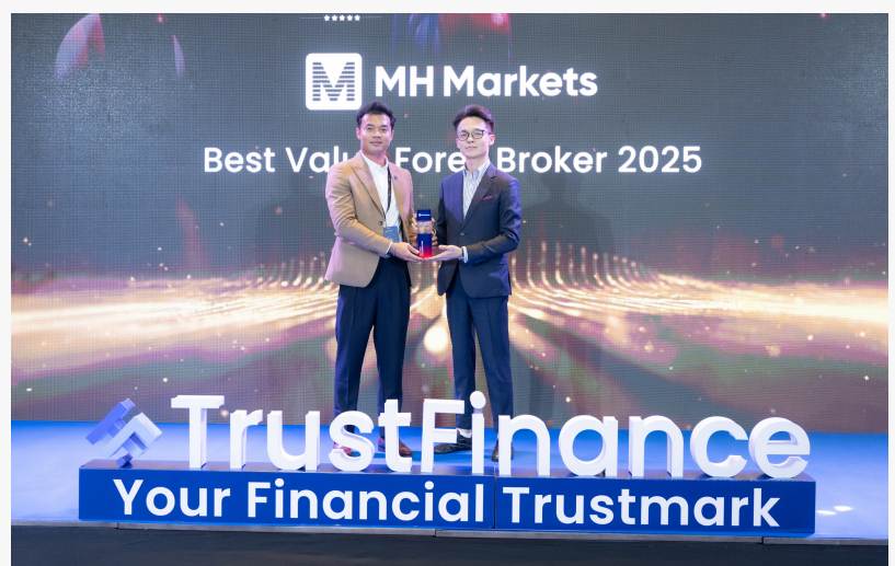
MH Markets Wins "Best Value Forex Broker 2025" at TrustFinance Business Bangkok 2025