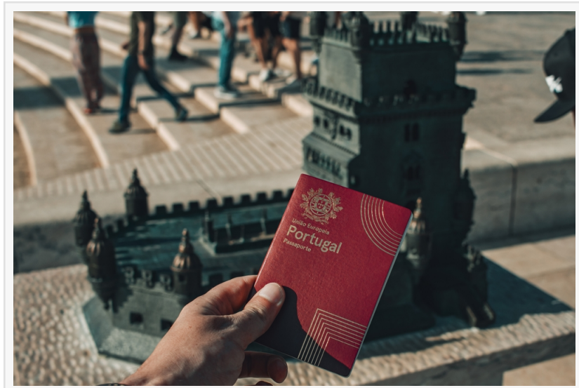
Portugal's Golden Visa remains unaffected by proposed citizenship changes

The potential reforms, debated last Friday by the Assembly of the Republic, do not directly target the Golden Visa residency-by-investment programme.