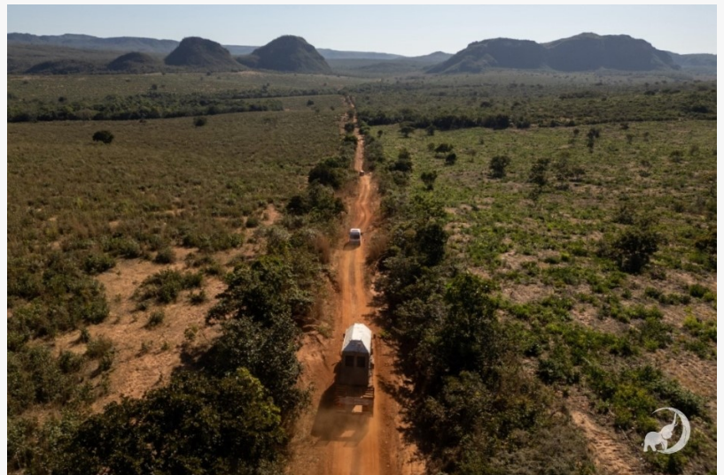
Kenya's caravan arrives at Elephant Sanctuary Brazil