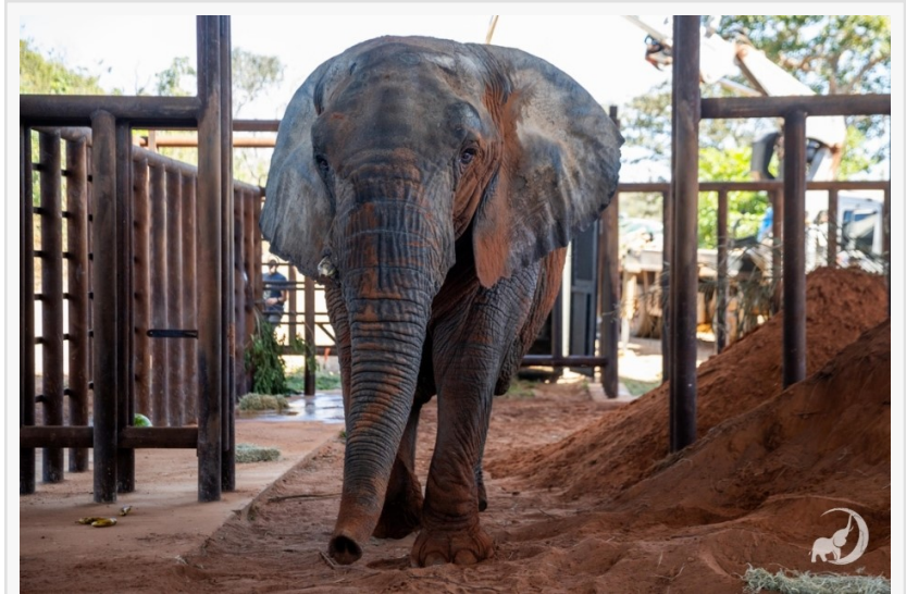
Kenya takes her first steps at Elephant Sanctuary Brazil

BRENTWOOD, TN, UNITED STATES, July 9, 2025 /EINPresswire.com/ -- Kenya, a 44-year-old female African elephant, has arrived at Elephant Sanctuary Brazil (ESB), completing a five-day, cross-continental journey from Ecoparque Mendoza in Argentina. Her relocation and transport were led by U.S.-based Global Sanctuary for Elephants (GSE), the only organization to establish and operate an elephant sanctuary in South America.