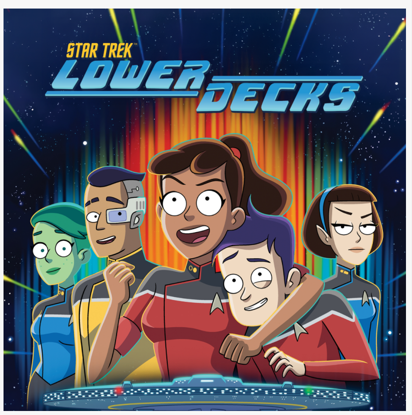
Read the new run of Star Trek: Lower Decks on GlobalComix.