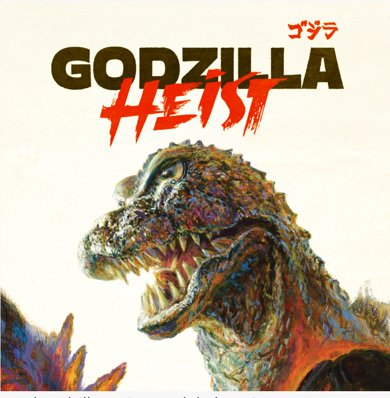
Read Godzilla: Heist on GlobalComix.

About IDW Publishing IDW (NYSE AMERICAN: IDW) is a leading media company providing uniquely compelling stories and characters in various genres for global audiences across all entertainment platforms. The award-winning IDW Publishing and IDW Entertainment divisions holistically evaluate and acquire IP for franchise development across comics and graphic novels, television, theatrical, merchandise, and other entertainment platforms, in addition to bringing world-renowned storytelling to life with our creative partners.