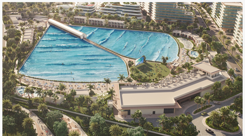
Bahrain Surf Park – Club Hawaii Experience