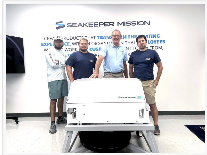
Team members of Gillen Yacht Services completed training and received Seakeeper certification from their training center.

About Gillen Yacht Services: Established in 1993, Gillen Yacht Services today provides a one-stop shop for yacht repair, yacht refit, and marine diesel repair solutions for a range of boats from sport fishing vessels to megayachts, guaranteeing a personalized service to its customer base in South Florida and beyond. With our new full-service location, multiple teams, and dedicated individuals